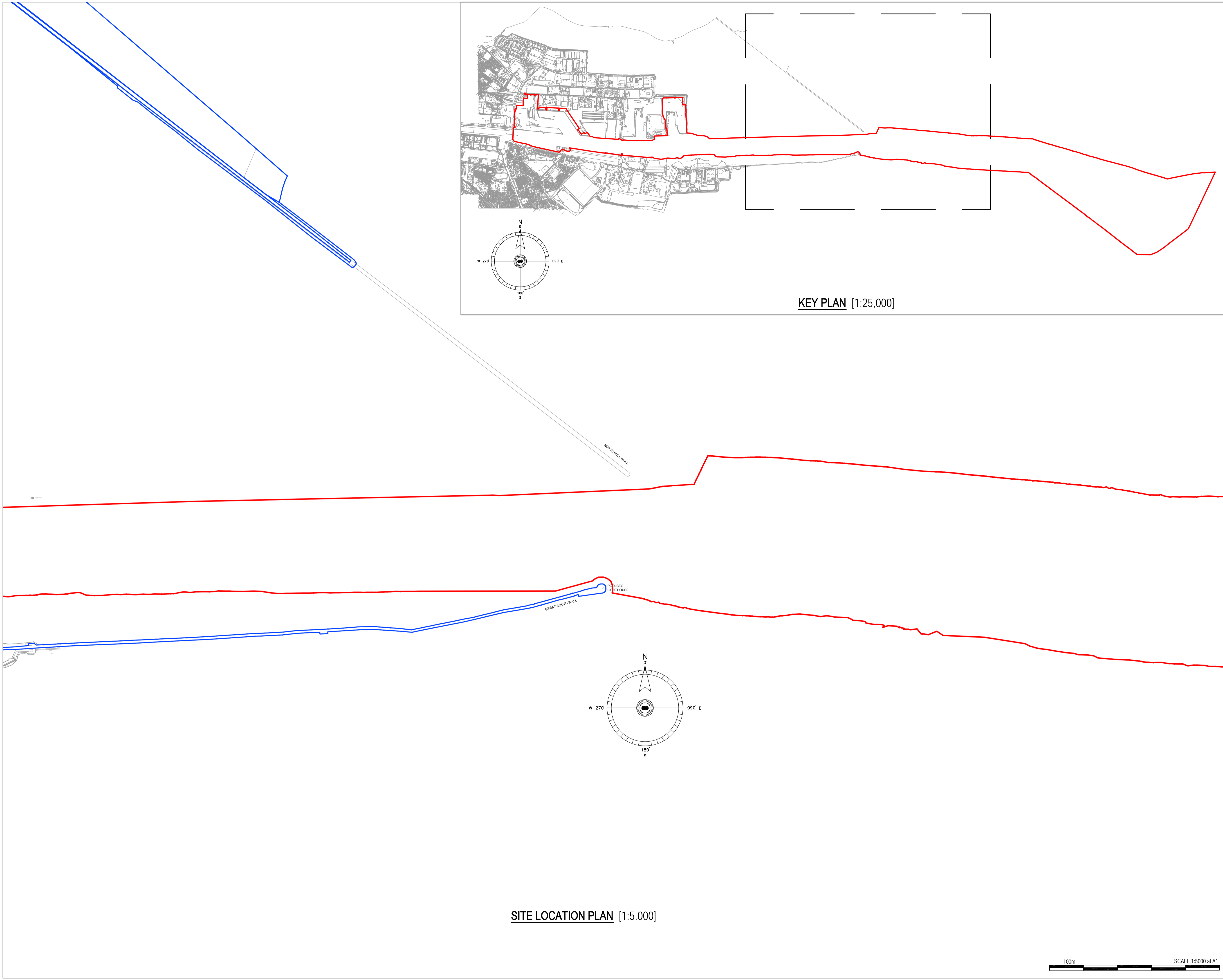
SITE LOCATION PLAN [1:5,000]